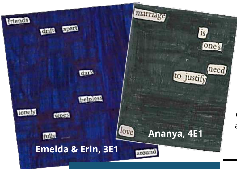
Emelda & Erin, 3E1

During English lessons, students got to vote at the canteen where the captions were displayed. This activity allowed students from all levels to unveil their creativity in creating captions. The winning captions were "relatable" and "humorous" to students.