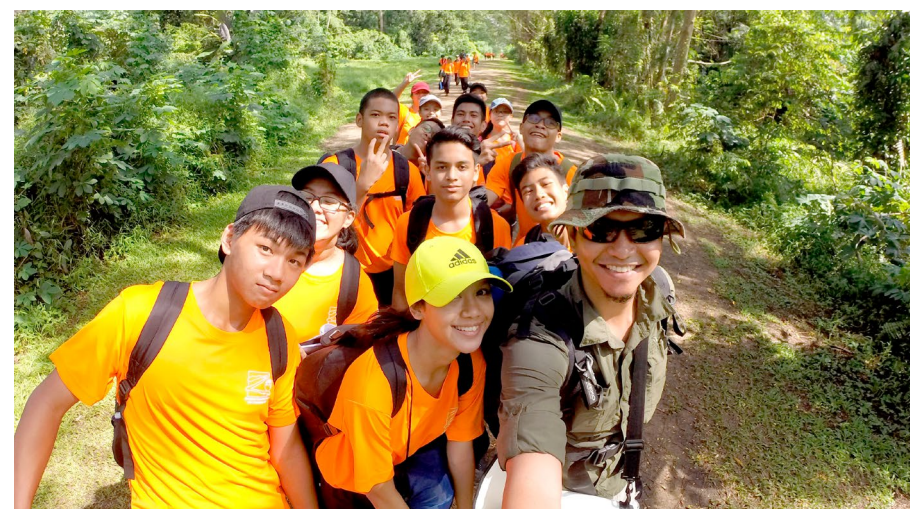
A class pauses for a wefie before ending the hike with some tent pitching (below right)

A key takeaway from the students was that the Adventure camp was more fun than