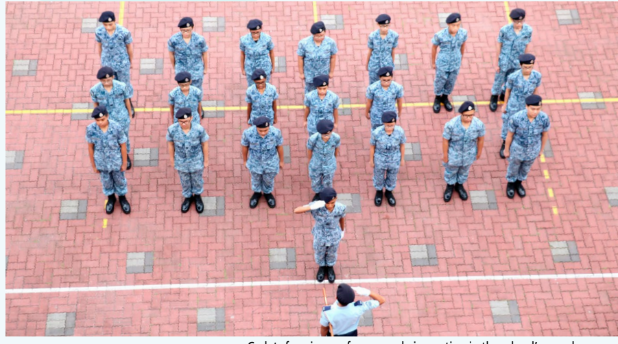
Cadets forming up for a parade inspection in the school's parade square

OUTDOOR ADVENTURE CLUB: Get outdoors and relish in the thrilling fun of activities such as camping, orienteering, hiking, and more. Members pride themselves on being open to new challenges and being resilient.