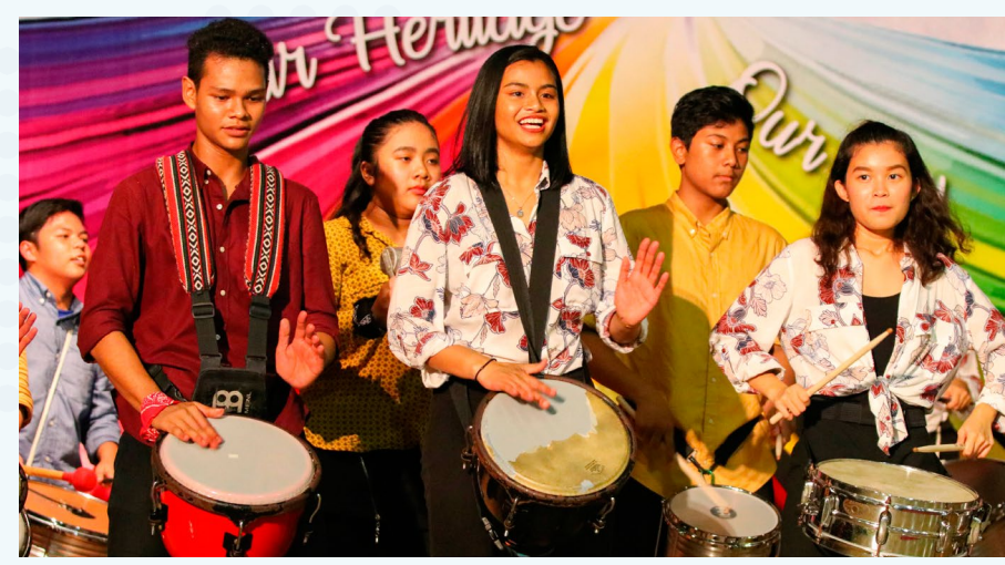
The Drums Ensemble performing on stage during Awards Day