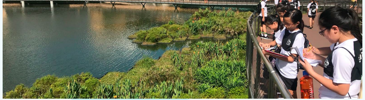
Students sketching the geographical features of Pang Sua pond as part of the programme